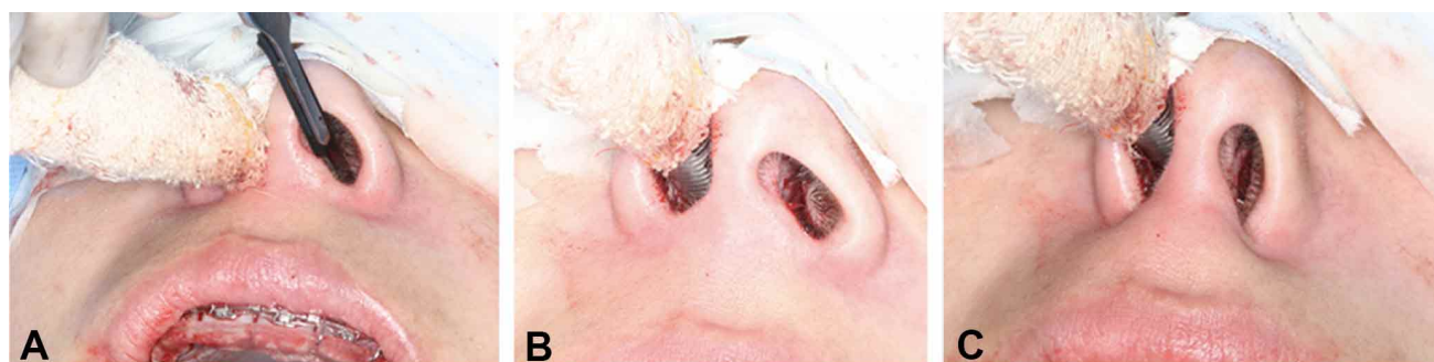
Fig 2. A) An incision in the inferolateral aspect of nostril, approximately 2 mm. This approach usually have little bleeding. B) Bilateral approach C) After bilateral approach, a traction in suture line is executed to take control of the nasal width. The knot and fixation is by intraoral approach.

Using distance between point B to C was measured the right and left nostril; alar nasal width or inter-alar width was obtained using the distance between points left A to right A point and the alar base width was obtained using the distance between the left and right D point. Distribution of data was confirmed and statistical analysis was realized using t test considering a p value < 0.05 to obtain statistical significance