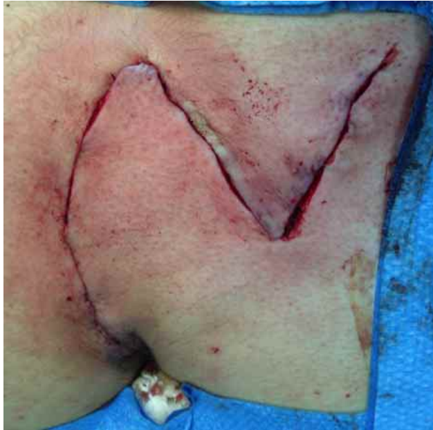
Fig. 5. Deep and superficial planes of the rhomboid flap sutured. Suction drain tube into deep space of the surgical area exteriorized by counter opening.