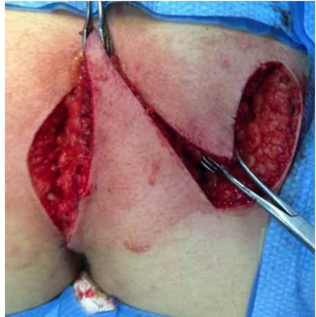
Fig. 4. Flap rotation.

without tension and would result in a scar parallel to skin tension lines is preferred (Fig. 4).