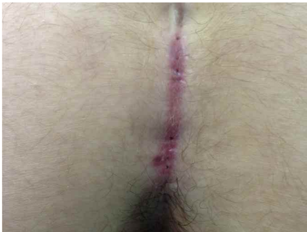
Fig. 2. Sacrococcygeal region. Several sinuses in the midline raphe can be seen.

Flap design: A diagonal line bisecting the 120° angle was elongated outside the defect on neighboring tissue with the same length as the diagonal. Next, on the basis of skin laxity around the defect, a donor area that could be closed primarily