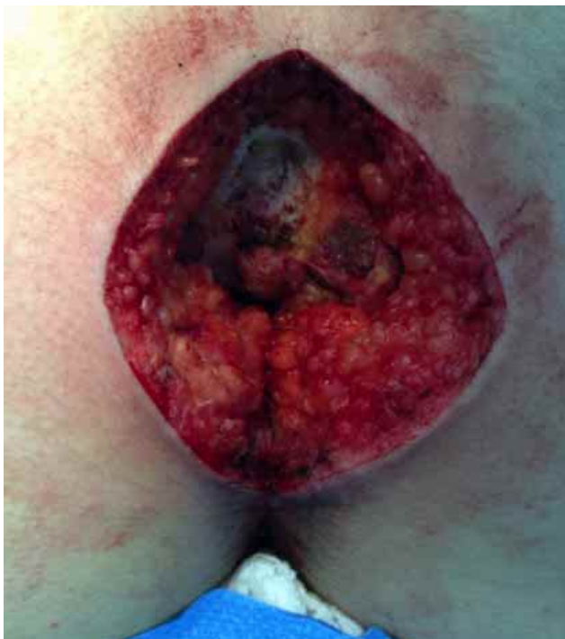
Fig. 3. Rhomboidal excision of the affected area until the presacral fascia.

without tension and would result in a scar parallel to skin tension lines is preferred (Fig. 4).