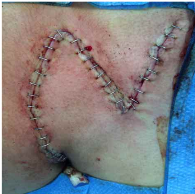
Fig. 6. Flap sutured and finalized surgery.