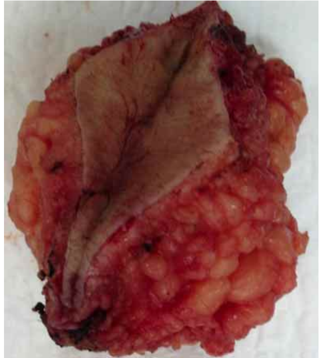
Fig. 7. Surgical specimen.

Pilonidal means "nest of hair" and derives from the Latin pilus (hair) and nidus (nest) (Manterola et al. ; Steele et al. , 2013; Sternberg, 2014), term used from 1830 onwards by Mayo (Koyfman, 2016). To this, was added "pilonidal cyst" proposed by Hodges in 1880 (Miller & Harding, 2009).