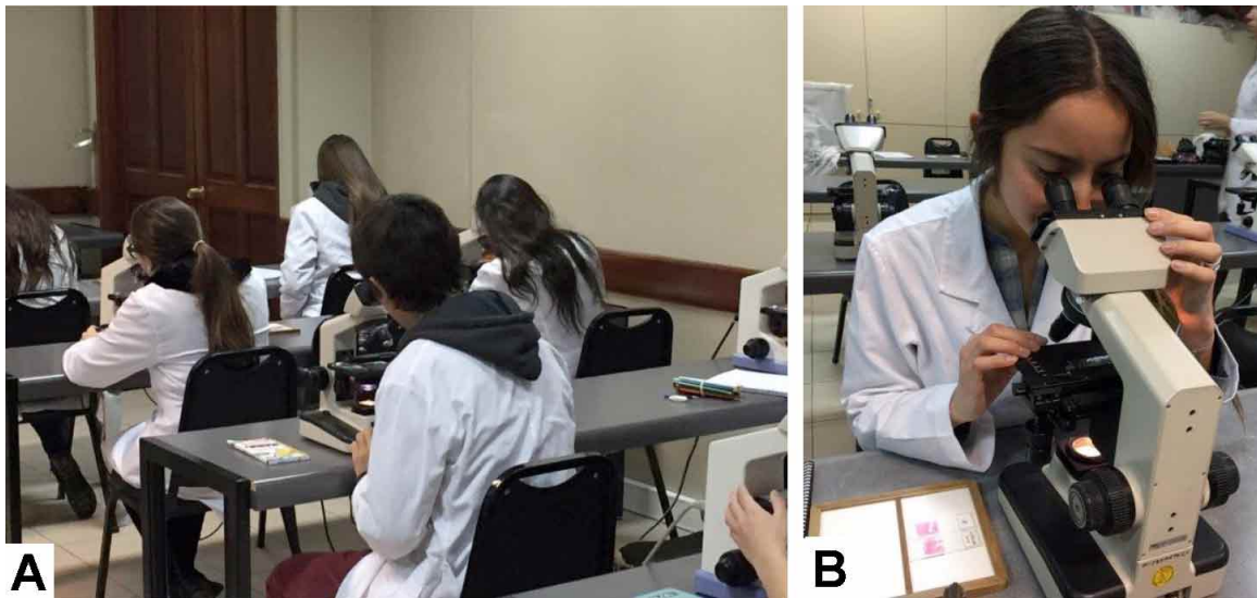
Fig. 2. Light microscopy experience. A) Group 1 performing with the traditional light microscope B) A student learning from light microscopy.