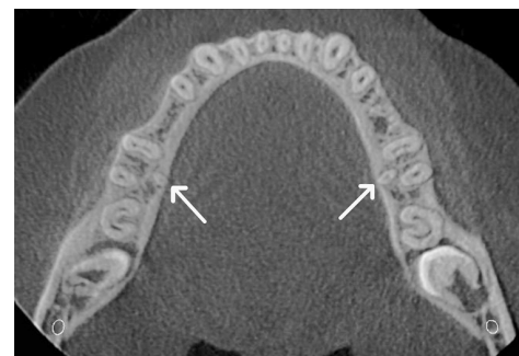
Fig 3. A case of a bilateral permanent three-rooted mandibular first molar in axial direction. White arrow indicates the extra distal root.